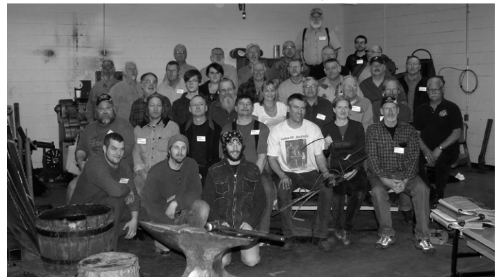
Blacksmiths from across Western Canada attended the WDM advanced blacksmith class in March, 2011 at the WDM Curatorial Centre in Saskatoon.