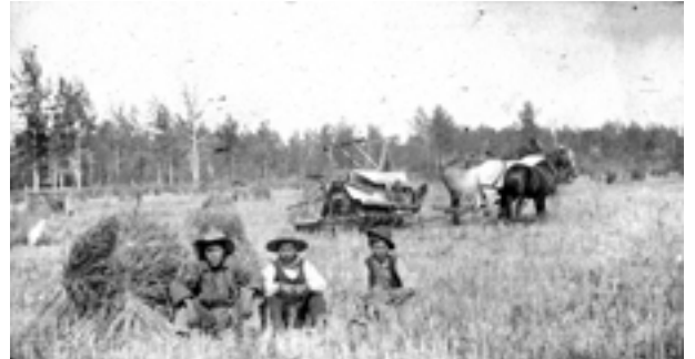
Métis and horse-drawn binder during harvest, circa 1910.