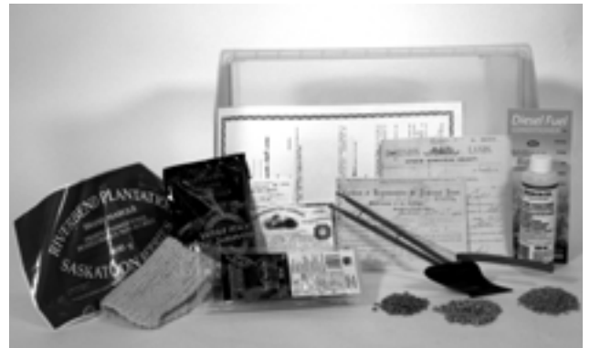
The first Métis in Saskatchewan were hunters, traders and ranchers who farmed to supplement their income. In the Métis Farming in Saskatchewan discovery box students will examine artifacts and discuss why Métis reacted to the new government land survey system. Students will analyze information from the 1885 Resistance to the 20 th century, exploring the lives of landed and landless Métis in Saskatchewan.