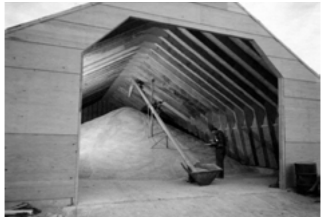
Grain storage shed at the Métis Farm at Lebreton, circa 1963.