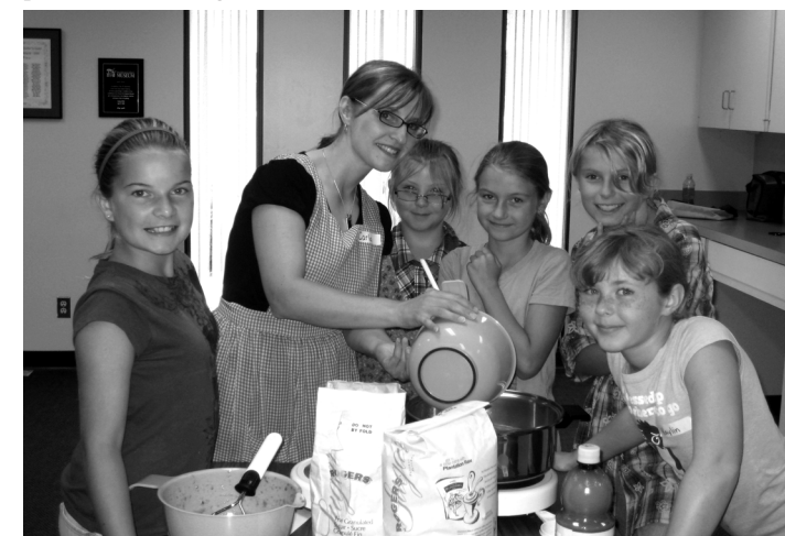
Yorkton's popular Children's Pioneer Days returns this summer.

Join us to welcome back Those Were the Days , this August 6-7. Take advantage of our WDM memberships and you can be at all of our summer events for one great price. For more information call (306) 445-8033 or visit our website at www.wdm.ca .